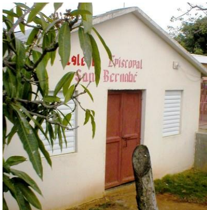
San Bernabé's present church