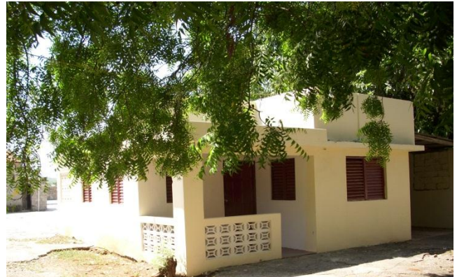
The San Bernabé house/preschool

termites – thus the need for a concrete roof. San Bernabé preschool (maternal & kinder) has 25 students. It meets in the little house on the property and provides a valuable service to the community. Rooms could be added to the house so as to expand the school. In the future a full range school could be built on the property and the present school converted into a vicarage for a resident priest.