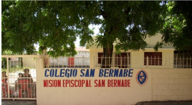
Entrance to San Bernabé

Construction team members will tie the reinforcing steel rebar for the new roof over the old warehouse so that the new flat roof can be poured. Previously the diocese will have torn down the old roof and poured the footers and columns that will support the roof. This will form a church building (sanctuary and altar area) of approximately 900 ft 2 plus the office & sacristy of approximately 165 ft 2 .