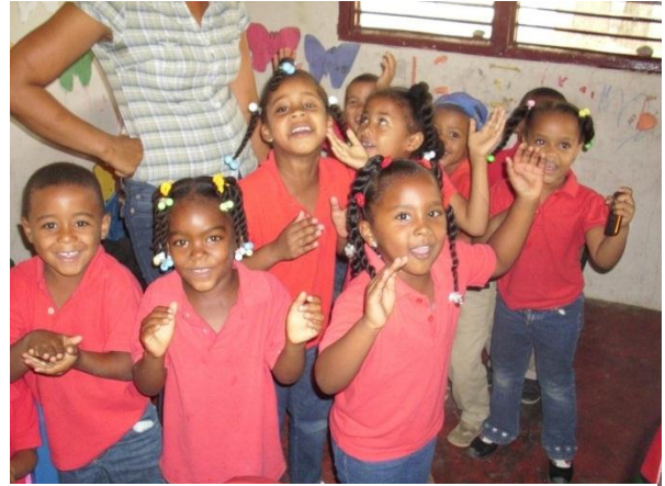
Children at colegio San Bernabé