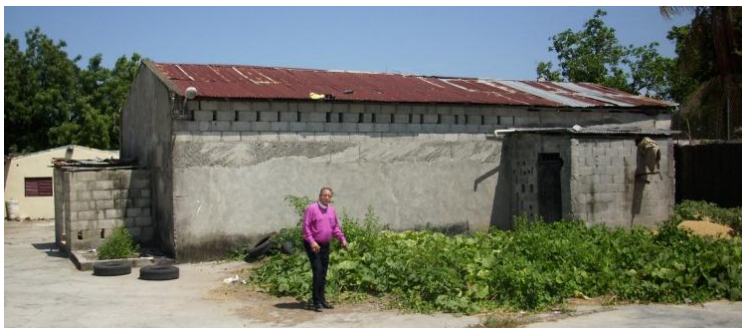
Bishop Holguín in front of old rice mill & warehouse.

Background: In the late 1990's the episcopal priest at La Transfiguración in Baní started visiting the rural village of Pizarrete just north of and on an access road from the main four-lane highway going from Santo Domingo to Baní. At first they met under the shade of a tree. Now they meet in the little church shown below. Pizarrete is about 50 minutes out of Santo Domingo by car.