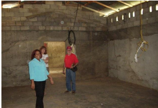
Inside the old warehouse.

the edge of the road which is currently rented out to sell lottery tickets. Most of the lot is covered by concrete a slab that could serve in the future as a base for a basketball court. The lot has water lines already installed, a cistern and a septic tank. The lot and the structures on it cost approximately $80,000.