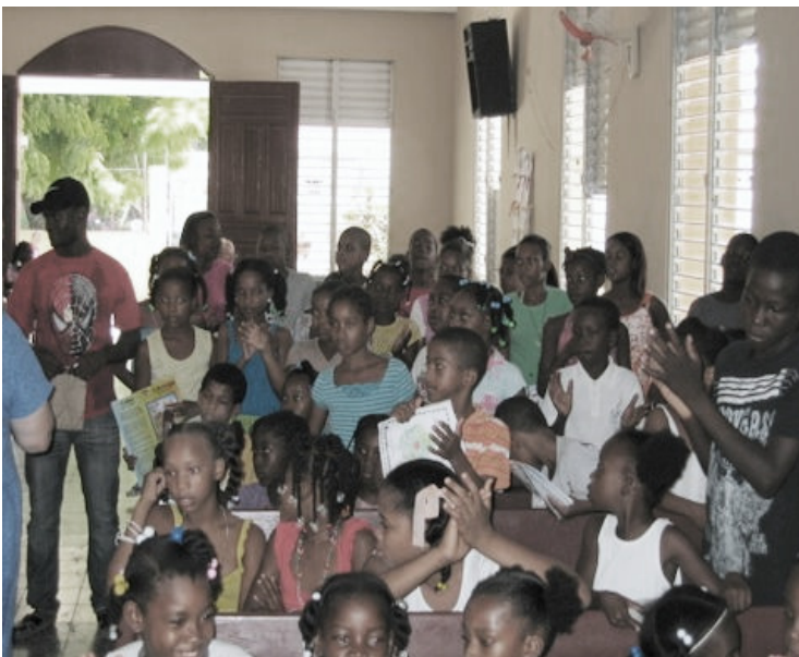
VBS'ers Gathered at Assembly.